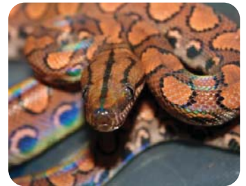
Rainbow Boa Epicratis cenchria

The Aquarium's Vet Lab staff recently focused our attention on snakes. We currently have five varieties of boa constrictor in the collection: Emerald tree boa, Rainbow boa, Madagascar tree boa, Amazon tree boa and the Red tail boa. Our goal with this year's physical exams was to establish consistent thyroid levels with this group. Snakes' thyroid glands are directly involved with shedding cycles and growth. By gaining information on normal levels of this hormone within our boa constrictor collection, we can actively manage our snakes' health and wellness.