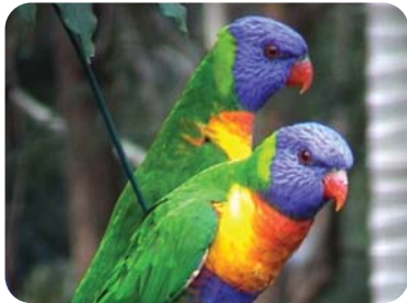
Swainson Blue Mountain Lorikeet Trichoglossus haematodus moluccanus

"I love working at the Aquarium," he said. "It's a great work environment, and there's always something fun to do."